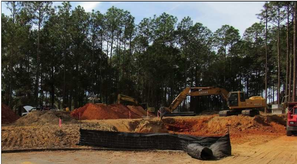
Digging to bury the large pipes and catch-basins needed for the infrastructure at VOA site.

The traffic light and intersection situation was briefly discussed. Our plan submitted to the city to make the Omni entrance and our entrance intersect has been acknowledged by council member Bess Rich, but no decisions have been forwarded. Meanwhile, the overall plan for Hillcrest Road is progressing slowly.