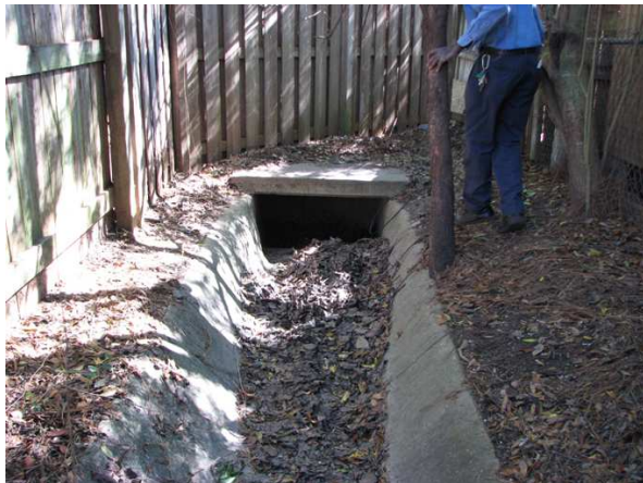
Drain areas located behind 1224 and 1228 are clogged with leaves and sand. Some shrubs and other growth also need to be cut back.

Thank you for all you do to keep our neighborhood attractive.