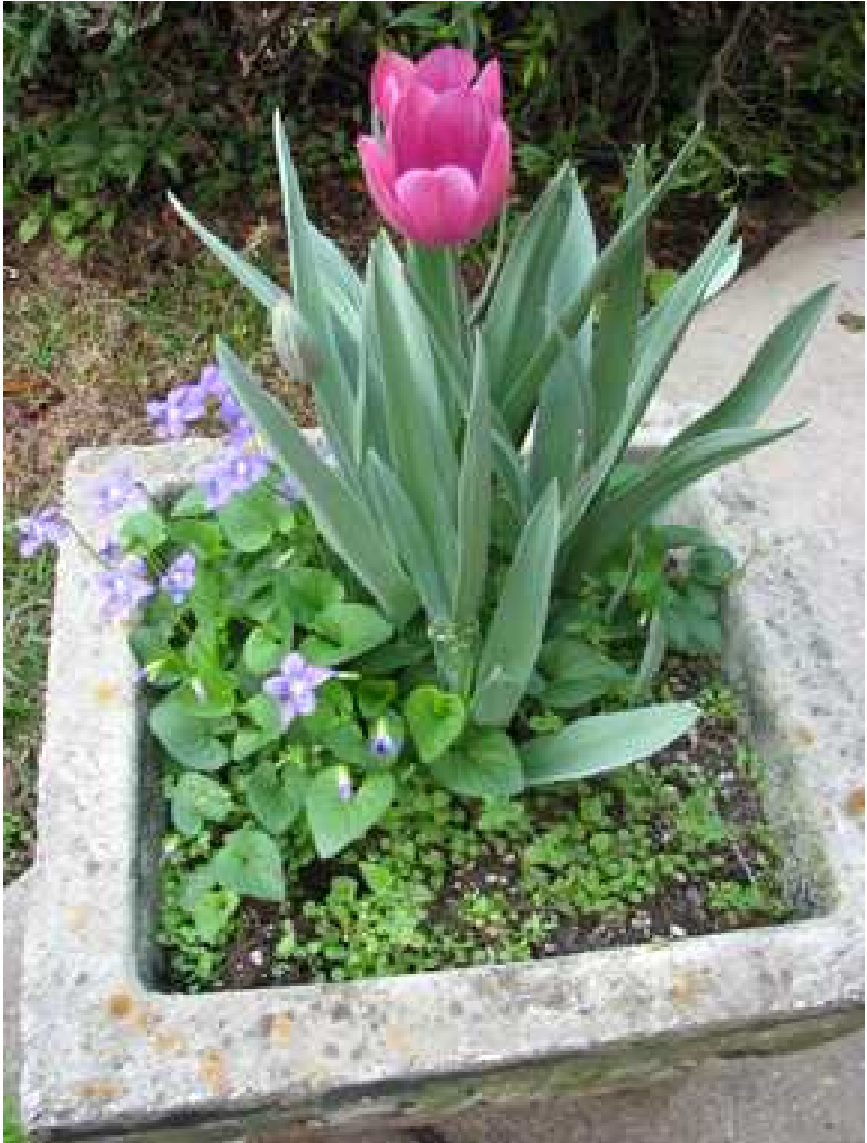
A little taste of Holland without the canals and harsh winter